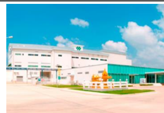
Thai Kyowa facility